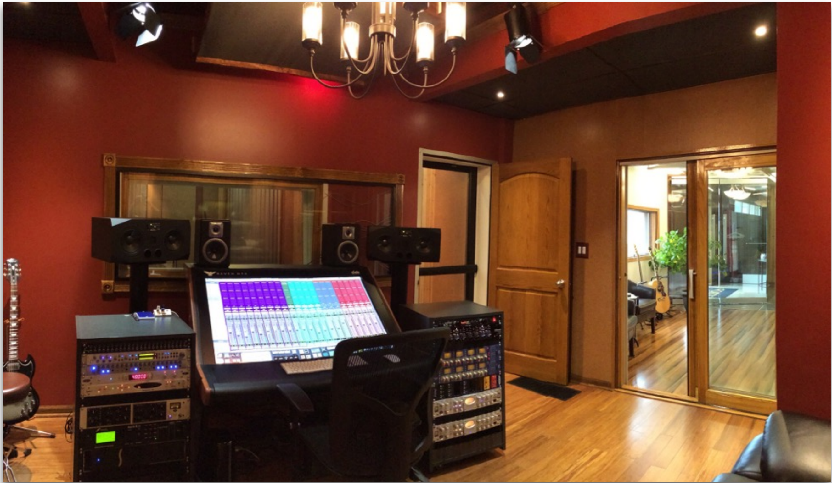
Pictured above: Control Room