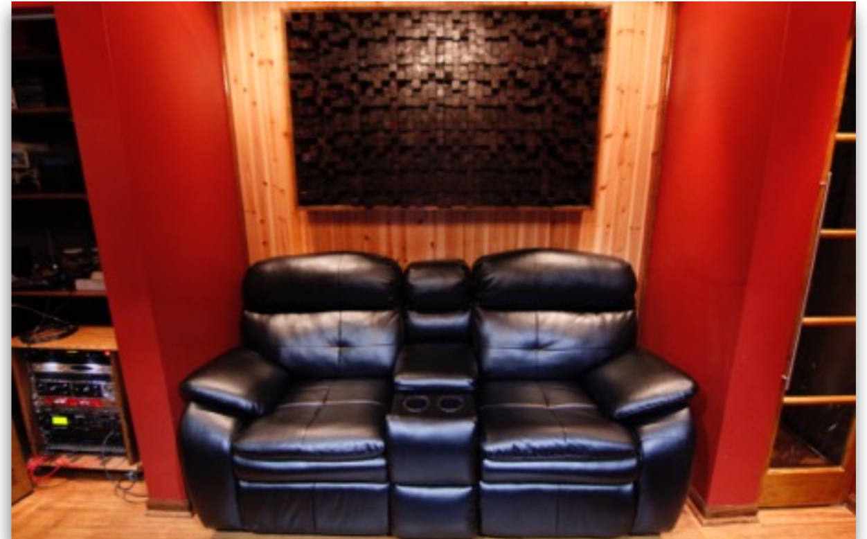
Pictured above: Customer listening position in the control room. A Two Dimensional Quadratic Residual Diffuser to control acoustics for accurate mixing and listening.