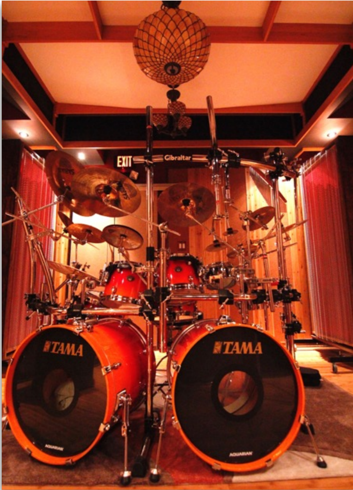
Pictured above: Drumset in Live Room B "the drum room"