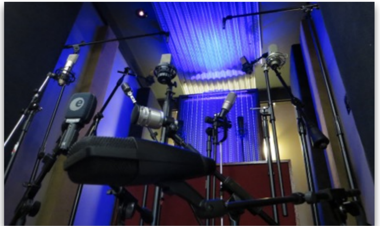
Pictured above: Various microphones in our collection situated in Isolation Room #2 "Vocal Booth"