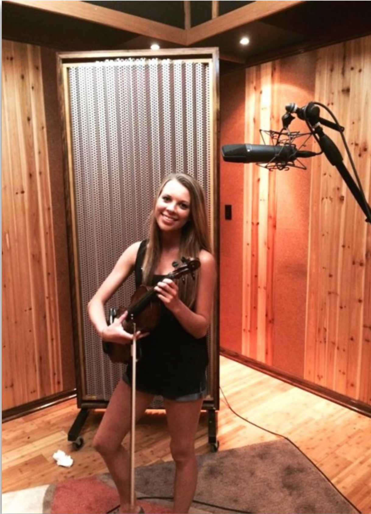
Pictured above: Artist records Violin in a Live Room