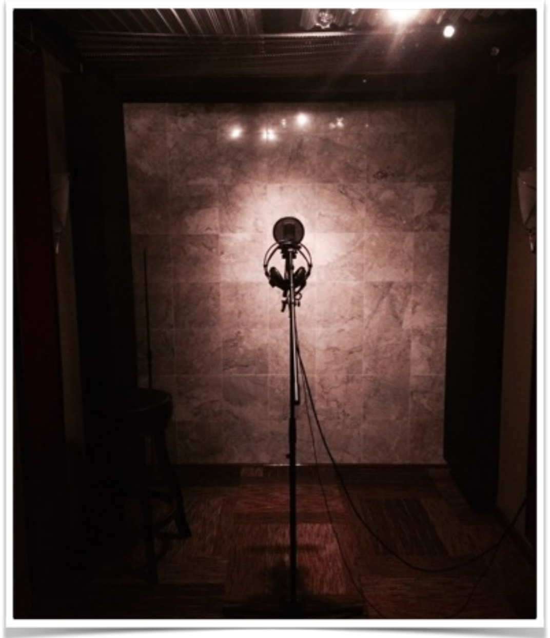
Pictured above: Isolation Room #3 illustrating the marble wall designed for customized acoustical attack and reverberation.