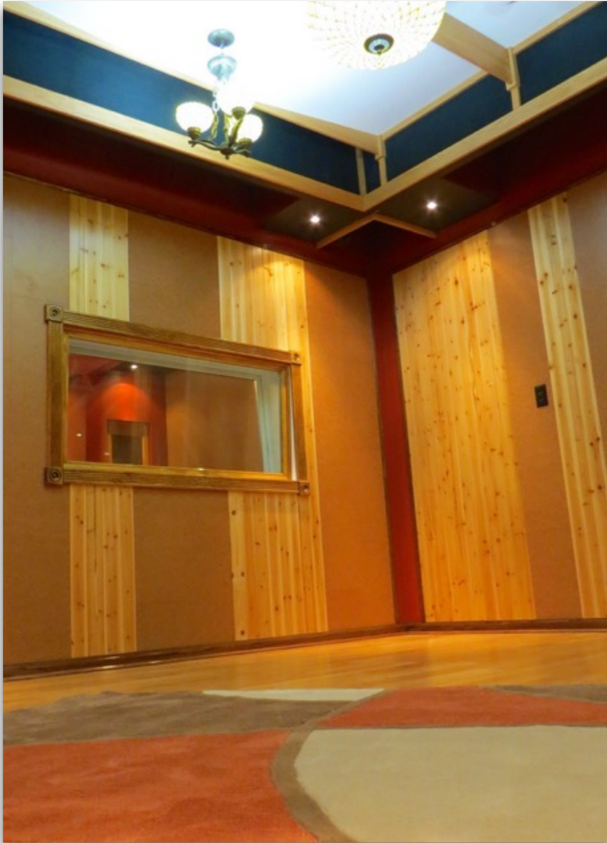
Pictured above: Live Room B looking towards the control room.