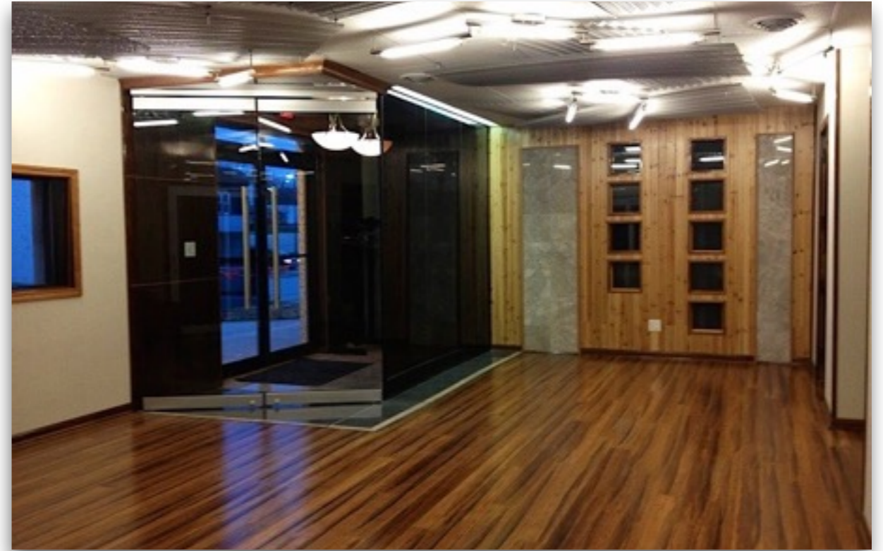
Pictured above: Entrance to Live Room A