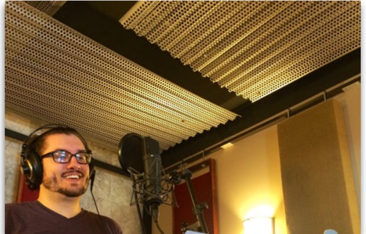
Pictured above: Artist records his vocals for an album in Isolation room #1