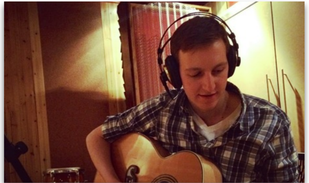
Pictured above: Artist recording in Live room B