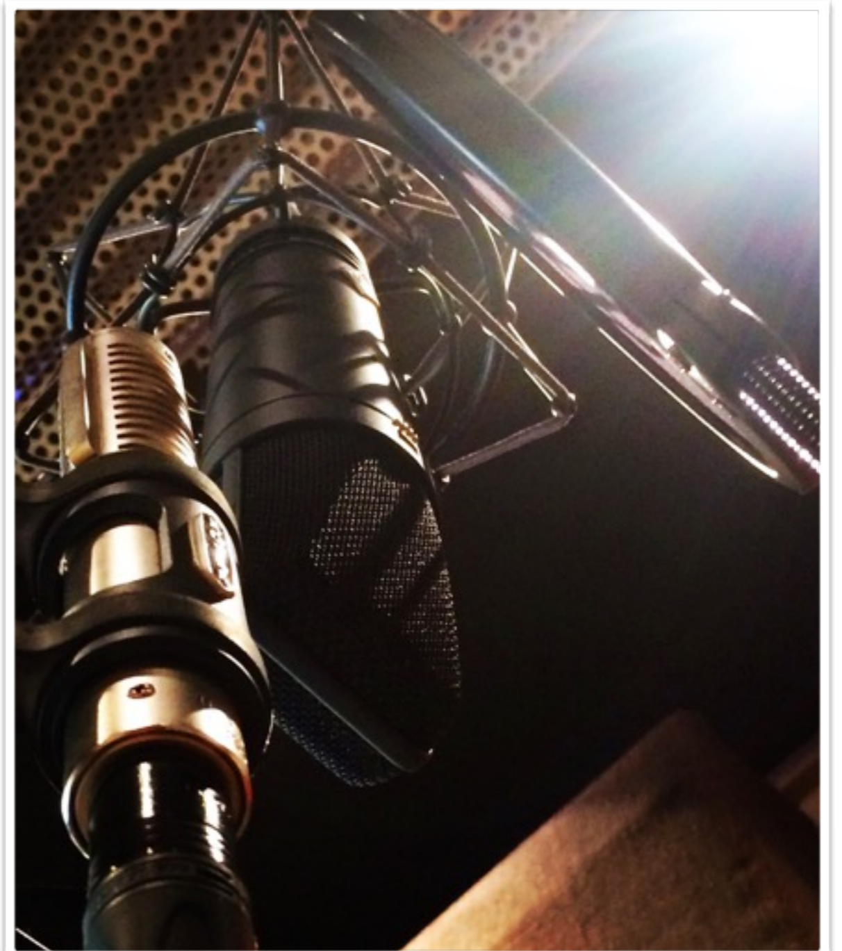
Pictured above: Neumann U87 recording microphone and Royer 121 ribbon microphone in our vocal booth.